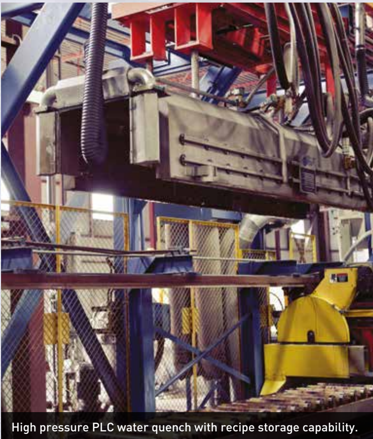
High pressure PLC water quench with recipe storage capability.

A wide variety of alloys are available within our inventory at all times, allowing customer selection to suit specific needs.