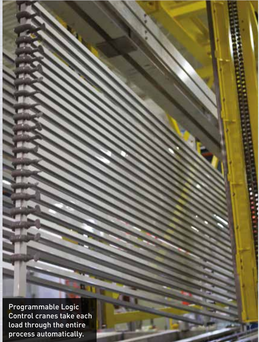
Programmable Logic Control cranes take each load through the entire process automatically.

Our wide range of anodic coating thicknesses and two-stage electrolytic colouring comply with AAMA 611 and MIL-A-8625 standards.